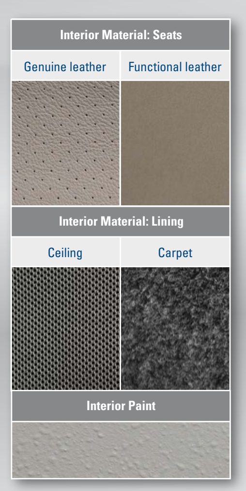
Equal features as for the High Standard Interior Design | Comfort through stageless adjustable seats